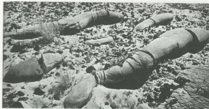
CONCRETIONS NEAR SALTON SEA

A VERITABLE hoard of nature's rare sculptures and one-of-a-kind ceramics awaits the imaginative explorer in