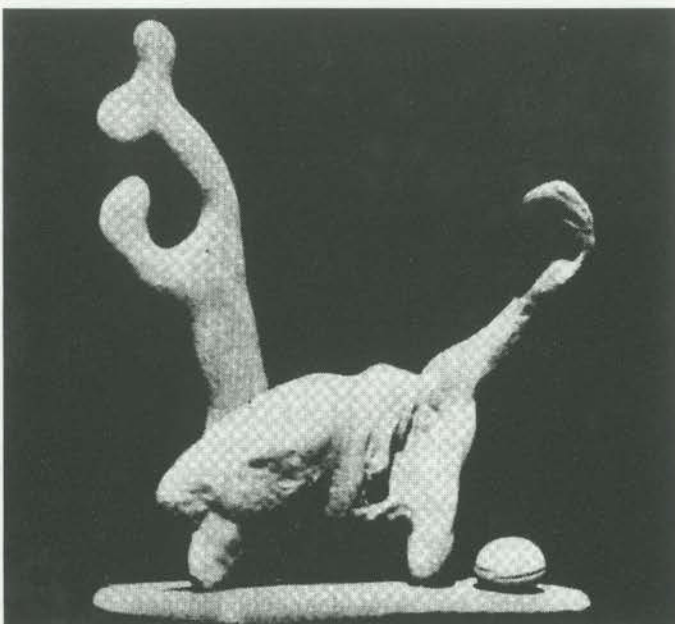
DINNY THE DINOSAUR

Several gunnysacks, a heavy screwdriver and few 10-foot bamboo poles comprise the only equipment necessary to a concretion sortie. In recent years we've found a newsboy's double pouch, slung over the shoulders to replace the cumbersome gunnysack, a solution for freeing hands and arms from the laborious toting task. The bamboo poles serve to mark a temporarily stashed cache for later pickup and a screwdriver is the tool perfect for scratching away sand which sometimes partially hides a worthy concretion.