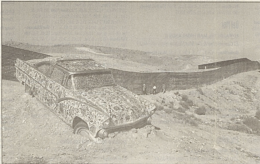
Betsabée Romero's "Jute Car," with its floral pattern on canvas and interior filled with paper roses, rests near the border fence in Tijuana's Colonia Libertad.

In visual terms alone, the effect is electric. It also sets in motion