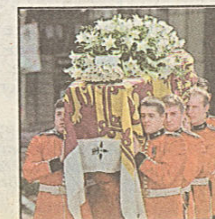
Princess Diana's funeral