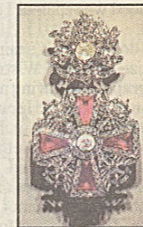
"Jewels of the Romanovs"