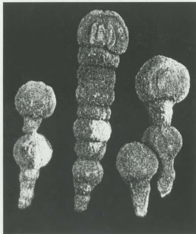
SAND CONCRETIONS (Multiples)

Nearly all the specimens secured from former trips showed no evidence of stratification while most of the